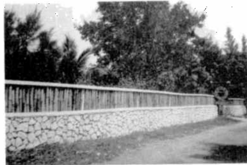
Fig. 5. The ornamental use of Bamboo with a stonewall.

Jamaicans in farming, especially animal husbandry. We noted above that in the early 19th century, Lunan praised the use of bamboo in pastures as a live fence and as a source of animal feed. Stewart (1969) who noted these uses also mentioned its value as a source of shade for cattle. In its 1954 guide to farmers, the Jamaica Agricultural Society describes bamboo as "often in pastures" and goes on to point out that: