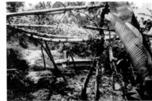
Fig. 8. A bamboo arbor.

Plant a stout log of bamboo upright so that the top is 3 or 4 feet above ground; split the topmost section . . . so as to produce about a dozen splints, all attached at the bottom, loose at the top, each splint being about 12 inches long; spread the splints outward and hold in position with a hoop of metal or withe; this produces a sort of raised basket, which is then lined with trash.