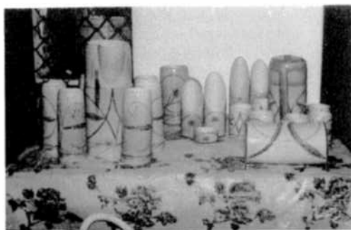
Fig. 12. An assortment of bamboo curios in the Kingston craft market.

openers, napkin rings, hand fans, and wind chimes.