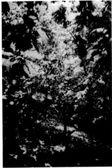
Fig. 10. Bamboo reaping stick.