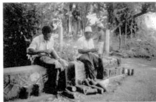
Fig. 13. Bamboo carvers at Castleton Botanical Gardens.

Underneath our house was a burn of crystal water, in which every evening our negro servant set his fish-pot for cray-fish and mountain mullet. His "pot" was a bamboo basket with a hole to admit of the entrance of the fish; and the bait was a Seville orange cut in two.