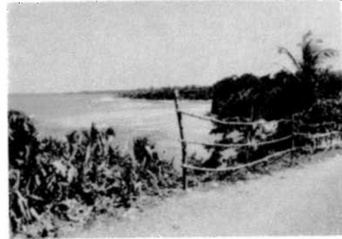
Fig. 11. A temporary bamboo guard rail in the parish of Portland.

An important contemporary use of bamboo as a "timber tree" is in constructing display boards,