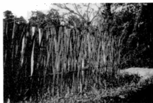
Fig. 4. A rough bamboo fence.

In addition to the domestic structures mentioned above, bamboo has also been useful to