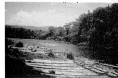
Fig. 14. Bamboo rafts on the Rio Grande River in the parish of Portland.

Bamboo, with its strong, hollow, tubular culms and branches, is ideally suited for making a variety of wind, percussion, and string instruments. In Jamaica, flutes, scrapers, vocal bases, bamboo trumpets (White 1982), an instrument called a bamboo stamping tube—and even a saxophone (Senior 1983)—have been made from bamboo. The traditional bamboo flute is called a fife and it is a key instrument in mento , one of the island's most important musical traditions. Bamboo fifes also appear in Jonkonnu bands in association with a variety of drums, cowhorns, scrapers and rattles (including jawbones and calabash rattles). Jonkonnu refers to a masked and costumed troupe of African-Jamaican street dancers who tradi-