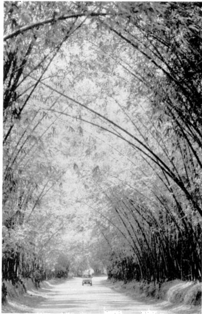
Fig. 1. Bamboo Walk in the parish of St. Elizabeth.

“flourishing in many different parts of [the] island.”