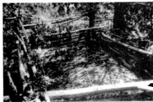
Fig. 6. A bamboo pig pen.

The Jamaica Agricultural Society also reports that "Bamboo is very popular for farm construction—fences, pig sties, fowl runs, rabbit hutches and feed hoppers, are all built of bamboo, to say nothing of its use for wattling houses and kitchens." One use of bamboo in animal husbandry is the making of a "fowl-nest" called a "bamboo pot." Cassidy and Lepage (1980:23) quote Decamp's 1958 instructions from the parish of Portland on the procedure for making one: