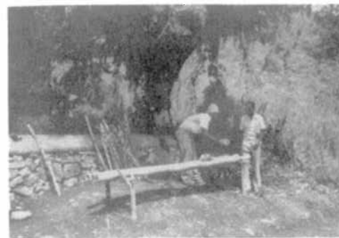
Fig. 7. A bamboo bench made by a roadside vendor of "jelly coconuts" and sugar cane.