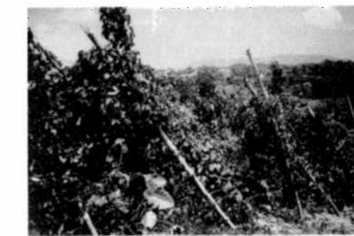
Fig. 9. Bamboo yam poles.

Because bamboo culms are strong, slender, tall,