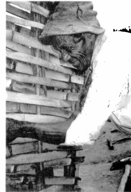
Fig. 2. The making of a bamboo screen for a detached kitchen.

Although more so in the past than at present, Jamaicans, particularly in rural areas, use bamboo to make houses, detached kitchens, and fences. Bamboo is used in several ways in constructing houses. Sometimes the whole structure—poles, roof, and walls—are made from bamboo. Traditionally, however, the poles are made of hardwood and wattled bamboo or other material is used to make the walls and partitions. Excellent photographic illustrations of wattled houses are presented in Johnston's Jamaica: The New Riviera (1903). Walls are also made from culms split in half and placed vertically in an overlap-