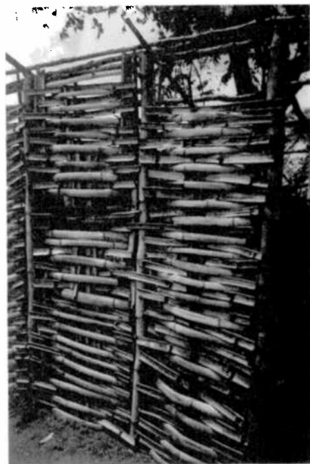
Fig. 3. A partially completed bamboo screen for a detached kitchen.

es and fences with bamboo rails (Cassidy 1961). Bamboo has also been incorporated into the construction of ornamental fences.